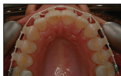
Figure 8: Upper arch after five months