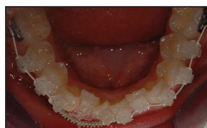
Figure 6: Braces on appointment. Open Coil Spring to create space for in-standing incisor