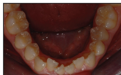
Figure 3: Lower arch before treatment