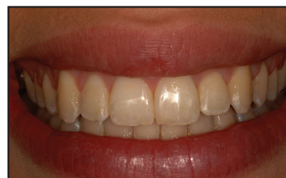
Figure 12: Post-operative smile