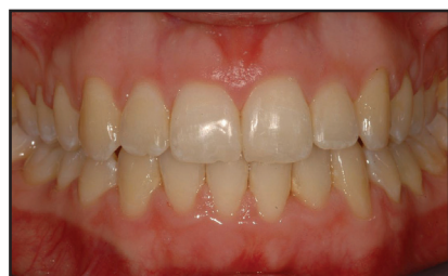
Figure 9: Post-operative retracted smile