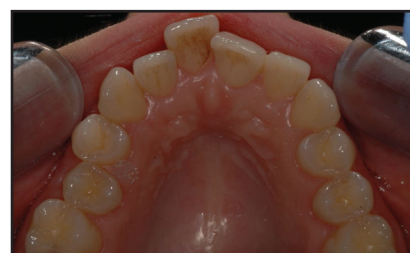
Figure 4: Upper arch before treatment