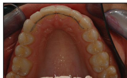
Figure 10: Post-operative upper occlusal view. Notice how the arch has rounded out. A bonded lingual retainer is placed for retention