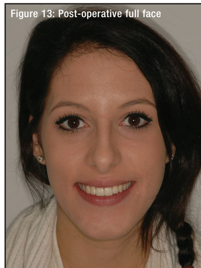
Figure 13: Post-operative full face

With all orthodontic treatment, it is important – especially in adults – to avoid relapse. As such, the patient should always be given retainers. In this case, we used bonded lingual retainers inter-canine, in the upper and lower arches (Figures 9 and 10), and the patient was advised that this is a lifetime commitment as part of the consent process.