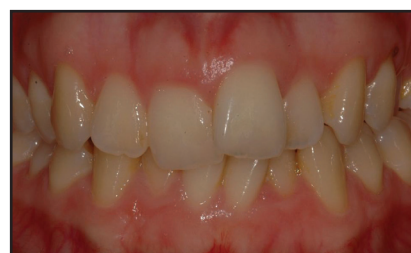
Figure 2: Patient's retracted smile before treatment