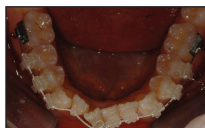
Figure 7: One month later, enough space is created by the coil, mild strip IPR and rounding out of the arch for the incisor to be directly engaged and brought into the arch