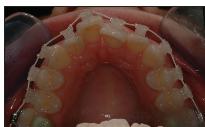
Figure 5: Upper arch after placement of Lucid-Lok brackets and NiTi wires