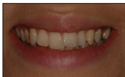
Figure 1: Smile before treatment

He is a clinical instructor for Six Month Smiles.